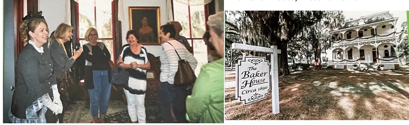
The Baker House, Historic Home