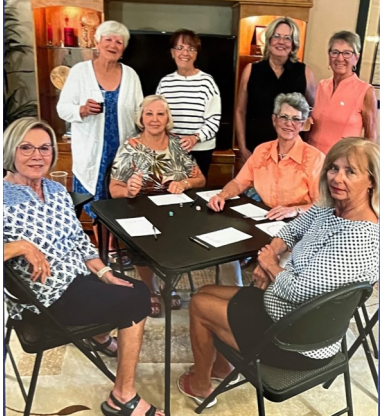
Ruth House Fundraiser & Tea House Fundraiser, Purses with a Purpose Bunco