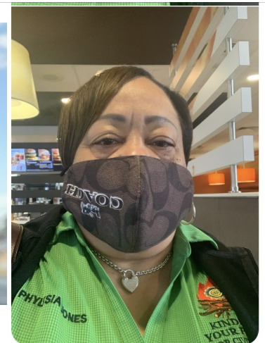
Shopability Saturday at McDonald's!

The club earned 20% of all sales during fundraiser hours. All events were successful thanks to our wonderful members and supportive friends. Proceeds from these fundraisers were used to make donations to Best Buddies for Cancer Research and Development and the Trinity Rescue Mission to assist with the needs of our growing homeless population.