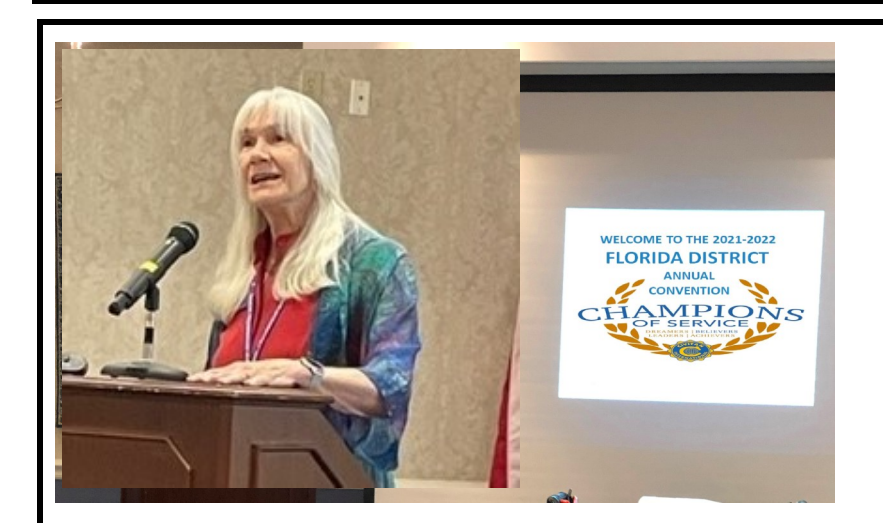
Governor Bonnie with opening ceremonies