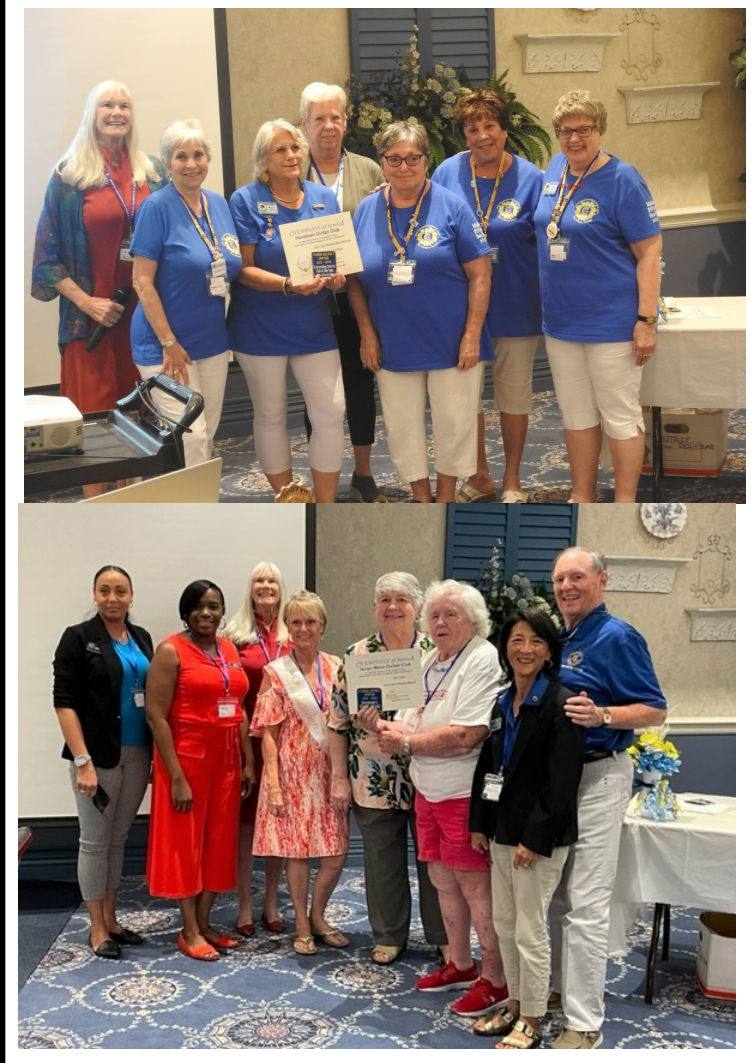
TAMPA METRO ... GOVERNORS CHOICE & MULTIPLE AWARDS