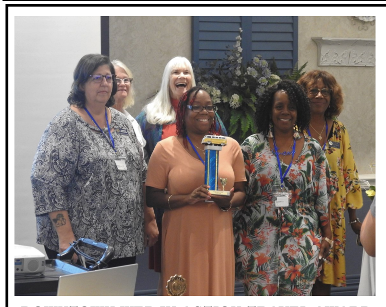
DOWNTOWN WEB IN ACTION TRAVEL AWARD