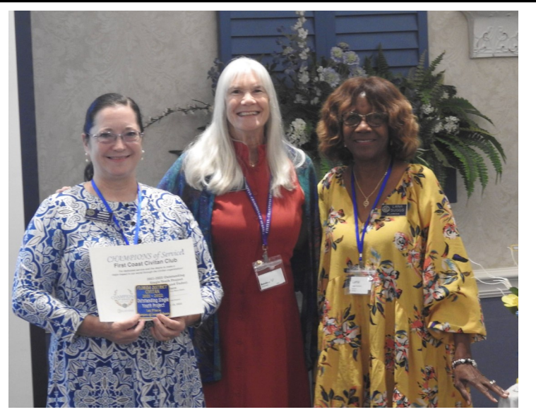
FIRST COAST .. MULTLIPLE AWARDS