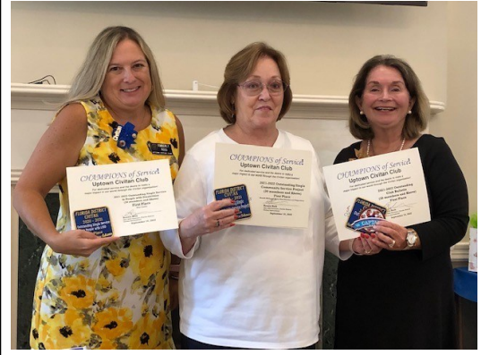
This leadership resulted in a number of awards at the District Convention but, more important, made a huge difference to many in our community.

Gratitude ...Uptown is fortunate to have so many members who do so much in the community to make a difference. Pictured here are the officers and committee chairs on my Board who helped lead the Uptown Civitan Club this year.