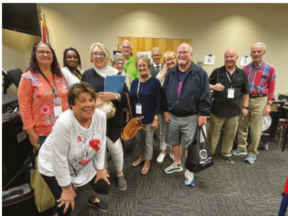
Hometown volunteers for early voting